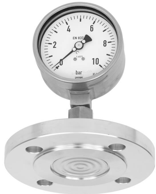
Diaphragm Seal, Flanged Process Connection Model 990.27 with Pressure Gauge Model 232.50 NS 100

Material stainless steel 316L, axial weld-in connection or adaptor G ½ female per EN 837-1, welded to capillary