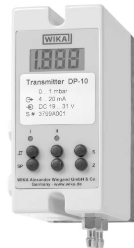
Pressure Transmitter model DP-10